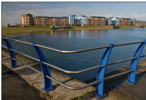
Llanelli Docklands New Housing Development