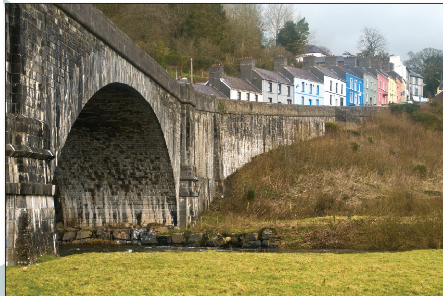
Llandeilo Bridge and Houses