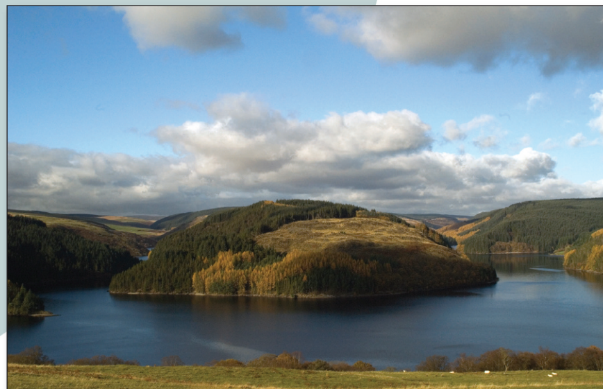
Llyn Brianne Reservoir

Left: Durtlie Valley in Autumn Near the confluence of the Durtlie and Tywi rivers, this remote location never fails to give a superb autumn display, especially from the myriad of silver birches growing hereabouts.