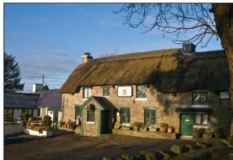
The White Hart