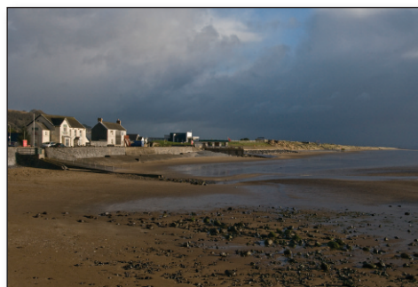
Pendine Beach Between Showers